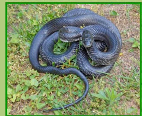
RATSNAKE Elaphe spiloides