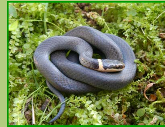
RING-NECKED SNAKE Diadophis punctatus