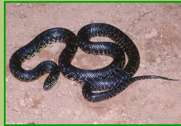
BLACK KINGSNAKE Lampropeltis niger