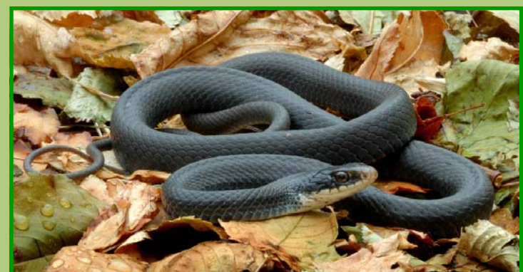
BLACK RACER Coluber constrictor