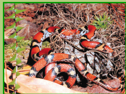
SCARLETSNAKE Cemophora coccinea