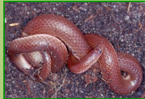
EASTERN WORMSNAKE Carphophis amoenus