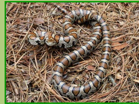
EASTERN MILKSNAKE Lampropeltis triangulum