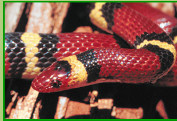
SCARLET KINGSNAKE Lampropeltis elapsoides