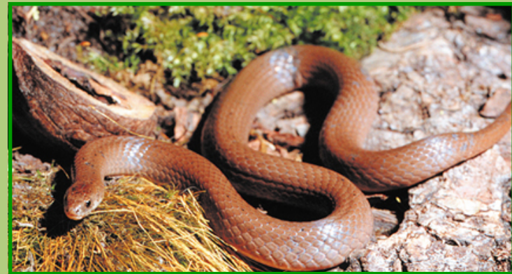
SMOOTH EARTHSNAKE Virginia valeriae