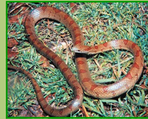
MOLE KINGSNAKE Lampropeltis rhombomaculata