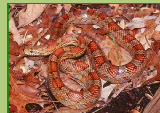
CORNSNAKE Elaphe guttata