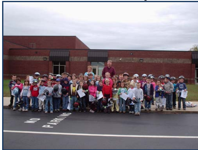
Service Coordinator and helmet promotion

Information on post-acute rehabilitation services, respite services, and day programs are included in the TBI clearinghouse.