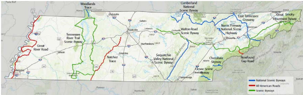
Figure 2 – Map of Tennessee’s Scenic Byways

Figure 2 below, shows Tennessee’s collection of Scenic Byways and which routes have received a “National Scenic Byway” or “All-American Road” designation.