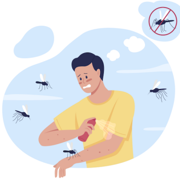
Protect Against Mosquitos!