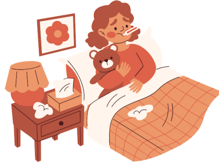
Common Cold, Flu, COVID-19?