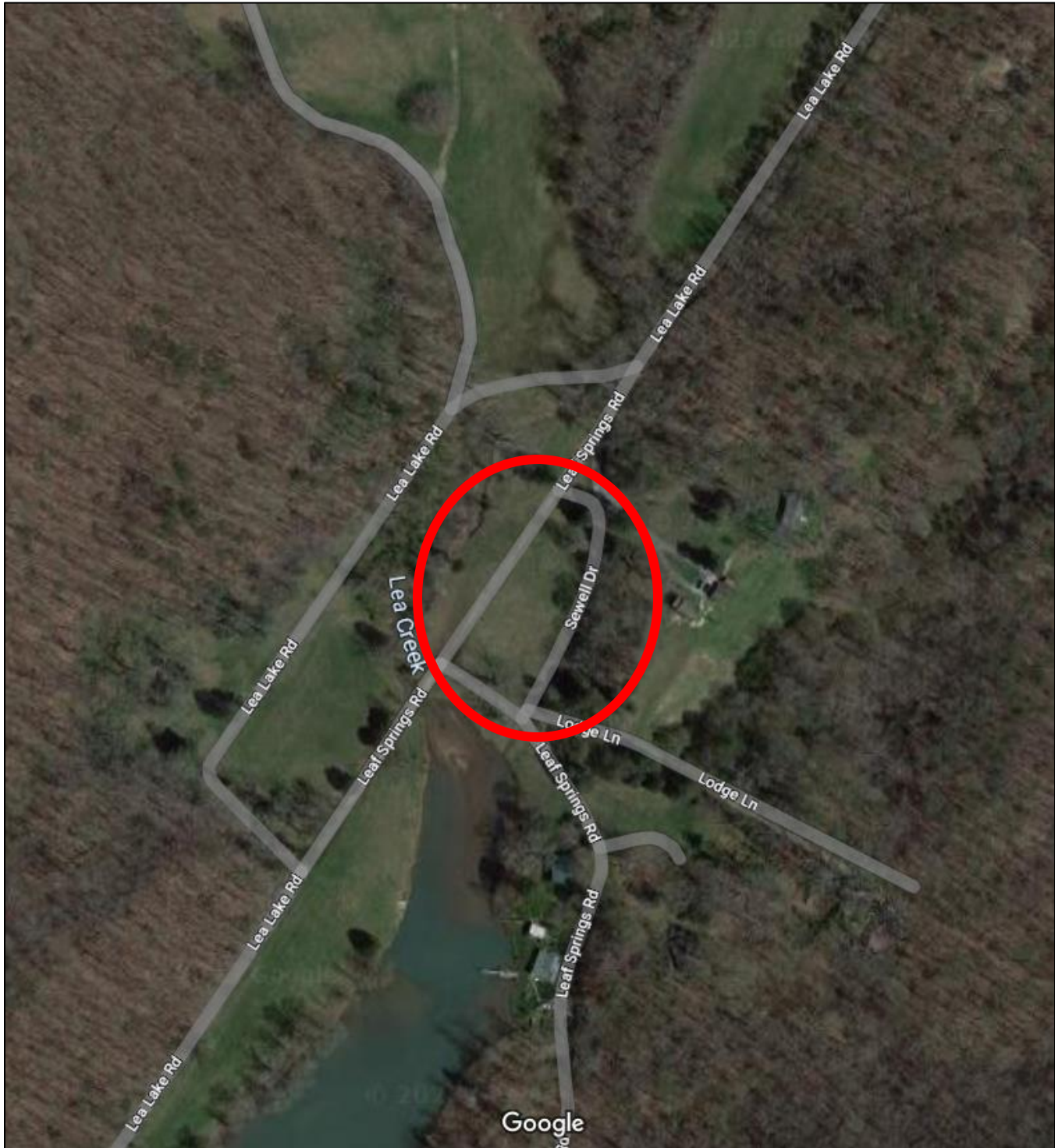
Figure 3: Vacant Lea Springs site (circled in red), 2023.