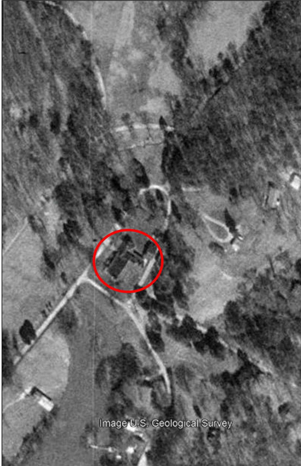
Figure 2: Aerial View of Lea Springs (circled in red), 1997.

Lea Springs Name of Property Grainger County, Tennessee County and State 75001754 NR Reference Number