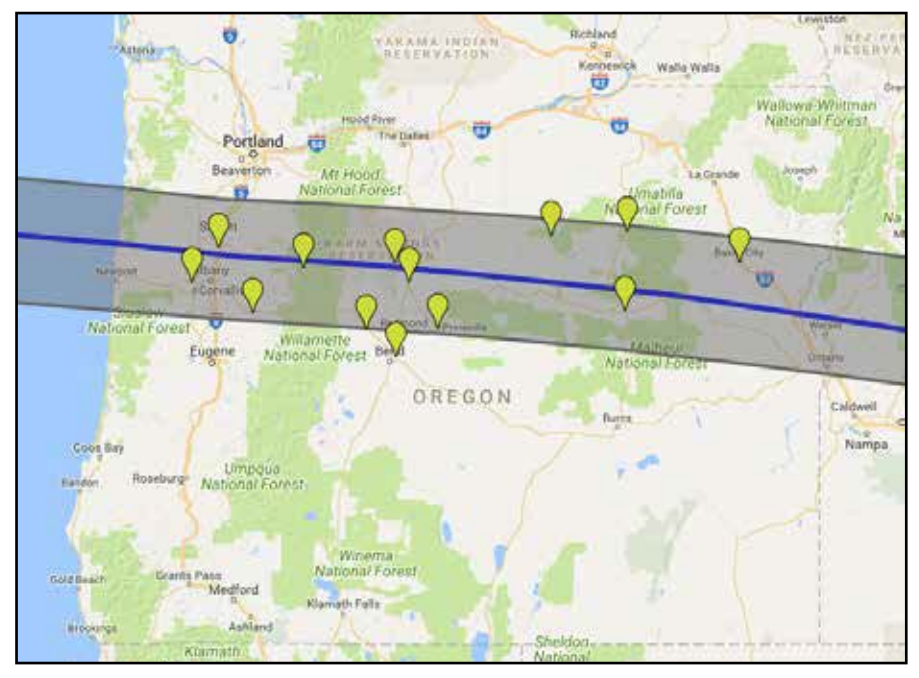
Fire Prevention Education Team locations

The three field teams were made up of 16 people total, tasked with implementing fire prevention messaging in and across nine national forests, grasslands, and Bureau of Land Management (BLM) and state protected lands in and near the path of totality. In the western part of the state, one team worked for the Willamette National Forest, Siuslaw National Forest, and the Northwest Oregon BLM District. In central Oregon, a team worked for the Deschutes National Forest, the Ochoco National Forest, and Prineville BLM District. Finally, in northeast Oregon, a team served the Malheur National Forest, the Wallowa-Whitman National Forest, and the Umatilla National Forest. The Warm Spring Reservation also hosted an FPET. The field teams focused on providing information along roads and gateways into the path of totality. They targeted messaging along roadsides, information portals and info stations, at events and public gathering places, and in and near campfire pits. By the time the teams demobilized, they had made 14,839 public contacts in 591 distinct locations and covered thousands of miles of Oregon roads.