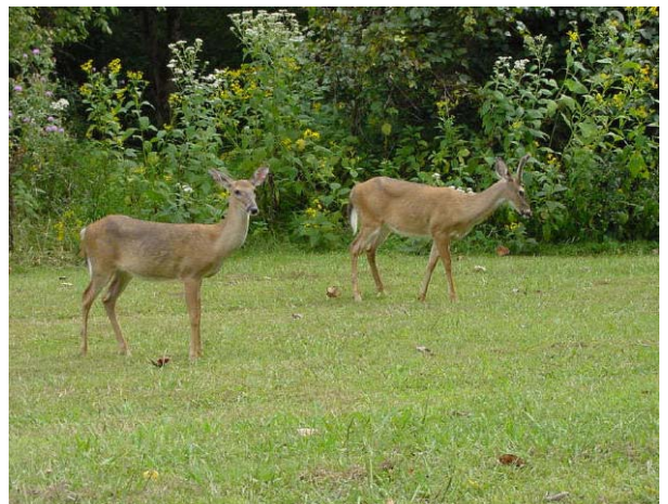
It's hard to visit Panther Creek without seeing at least one deer!