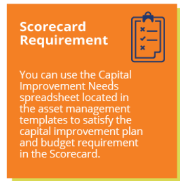
Figure 1 Capital Improvement Plan Scorecard Requirement

In addition, this AMP guide also addresses DWR Drinking Water program and SRF program requirements for Asset Management Planning and Fiscal Sustainability Plans. While some program requirements may have slight modifications or go beyond this basic AMP format, the foundation is the same. More detailed plans (e.g., Master Plans, Capacity, Management, Operation, and Maintenance (CMOM) Plans, Infiltration / Inflow Assessments, Leak Detection Studies, etc.) are often required to support investment decisions, critical needs, or in response to significant non-compliance issues. We suggest users of this guide check with DWR program staff prior to substituting this AMP model in lieu of (or to fulfill) regulatory or loan program requirements.