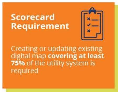
Figure 7 Digital Map Scorecard Requirement

A utility may digitize paper maps by scanning and tracing, or as a guide to place asset features in their approximate location. Often both digital and paper drawings include attribute information (size, material, etc.) that should be populated into the asset inventory spreadsheet or into the GIS layer. Leveraging existing documentation is the most cost-effective method of developing a digital map.