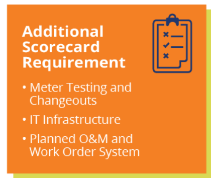
Figure 14 Additional Scorecard Requirements