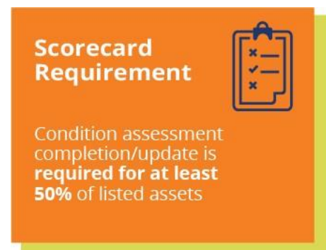
Figure 5 Condition Assessment Scorecard Requirement

Practitioners need to take inventory of utility assets, listing what is owned, documenting the location of each asset, and detailing the condition of the asset. This data should be gathered in one location and be comprehensive, including new and old assets in the system.