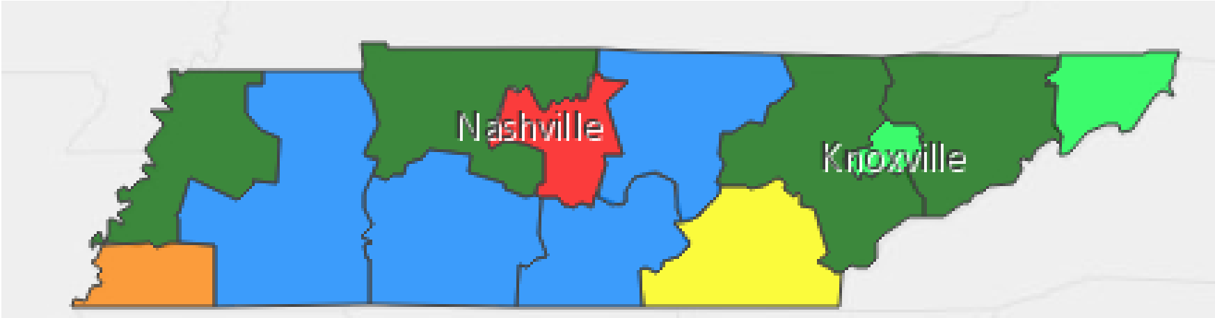
Employment Data Area Distribution