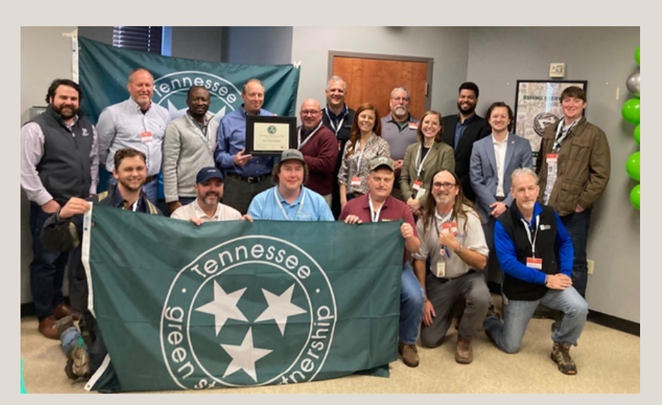
Celebrating our latest partner industry, Nucor Steel in Memphis, with representatives from the TDEC Memphis Field Office.

As we end 2022, the Office of Sustainable Practices takes this opportunity to thank our partners once again for all they do.