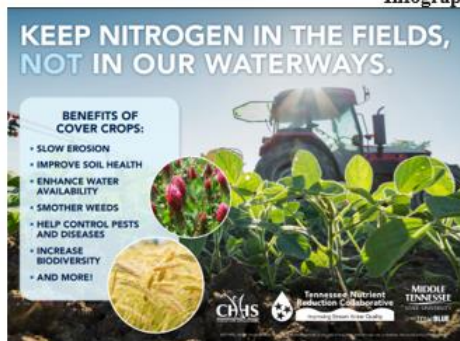
Infographic Drafts: Batch 1