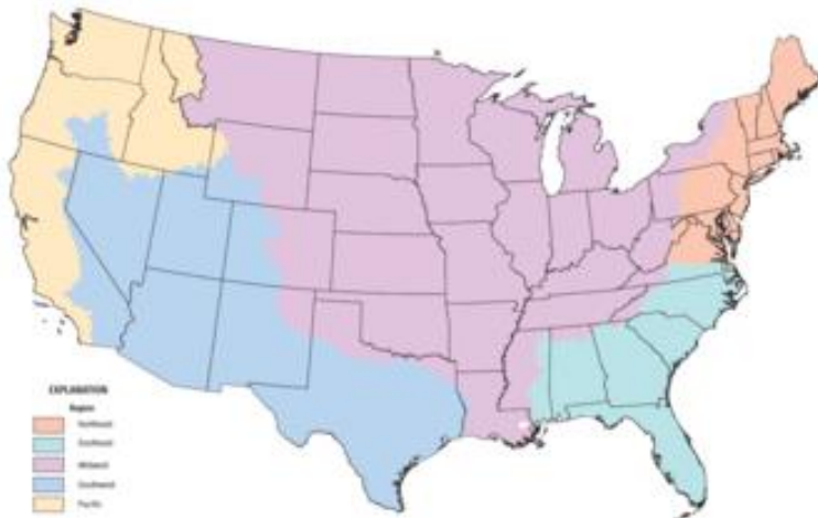
The regions delineated for use in Spatially Referenced Regressions on Watershed Attributes (SPARROW) models in the conterminous United States

The U.S. Geological Survey's SPARROW (SPAtially Referenced Regression On Watershed attributes) is one of the leading platforms available for measuring/estimating nutrients for a location based on human activities, watershed characteristics, and natural processes. The taskforce learned that SPARROW models estimate the amount of a contaminant transported from inland watersheds to larger water bodies by linking monitoring data with information on watershed characteristics and contaminant sources. They were also educated on the