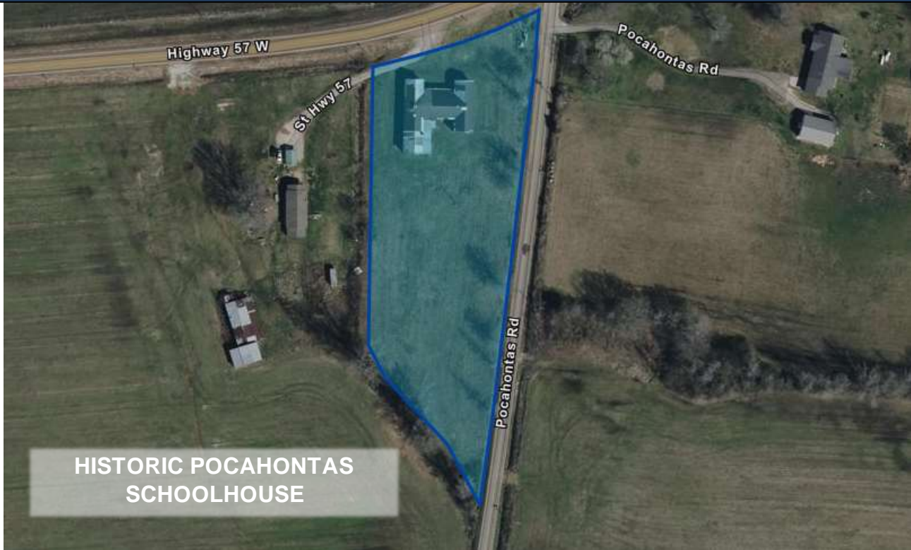
HISTORIC POCAHONTAS SCHOOLHOUSE

22590 State Highway 57 – Pocahontas (Hardeman Co.), TN