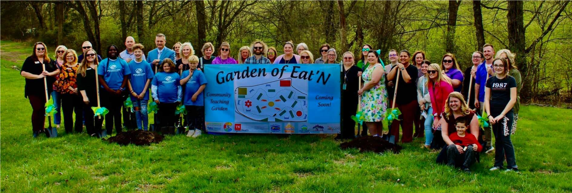
Ground Breaking: March 1, 2023