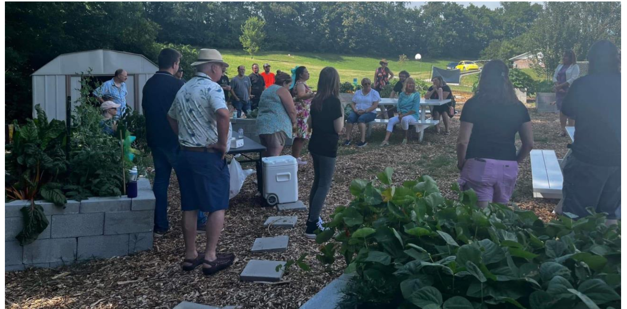
Grand Opening July 14, 2023