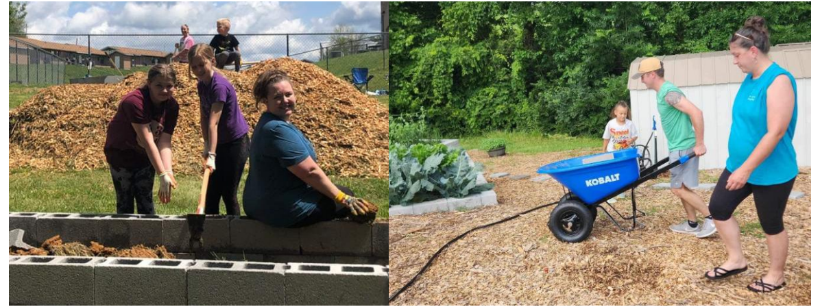
Community Workdays May 20 & July 6, 2023