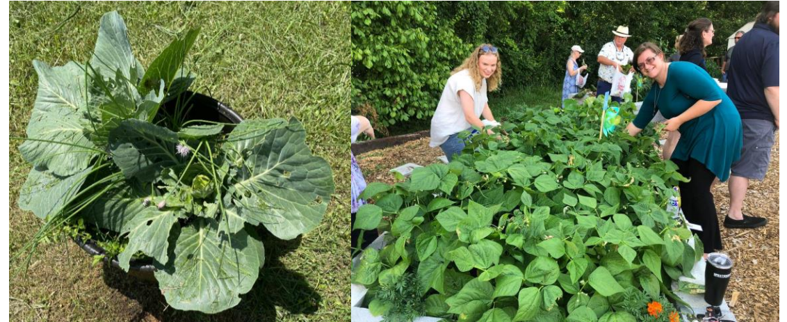
Cabbages succumbed to caterpillars; beans to Mexican bean beetles