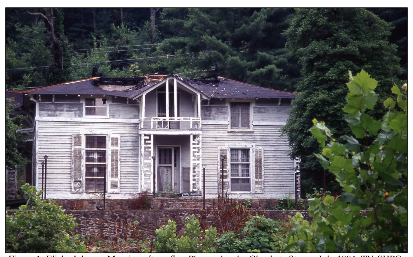
Figure 1: Elisha Johnson Mansion after a fire.