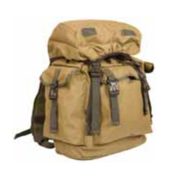
Update Comfort Bags every 6-12 months.

These packs should be available to all staff and taken on each drill when leaving your usual location, even if staying within the building.