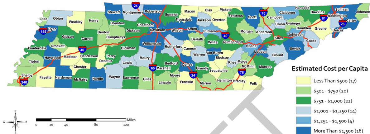
Map 8. Estimated Cost of Infrastructure Improvements Completed Per Capita Infrastructure Needs Reported July 1, 2009, and Completed by July 1, 2014

The following maps suggest an explanation for the contrast between maps 7 and 8. There are exceptions of course, but counties in the top three or four tiers for infrastructure needs per capita (map 7) are more likely to be in one of those tiers for improvements completed per capita (map 8) if their per-capita tax bases are also in one of those tiers (maps 9 and map 10). For instance, Van Buren County is in the first tier for improvements needed per capita, improvements completed per capita, and property tax base per capita (maps 7, 8, and 9), despite having a per-capita sales tax base in the bottom tier, one of the nineteen smallest in the state (map 10).