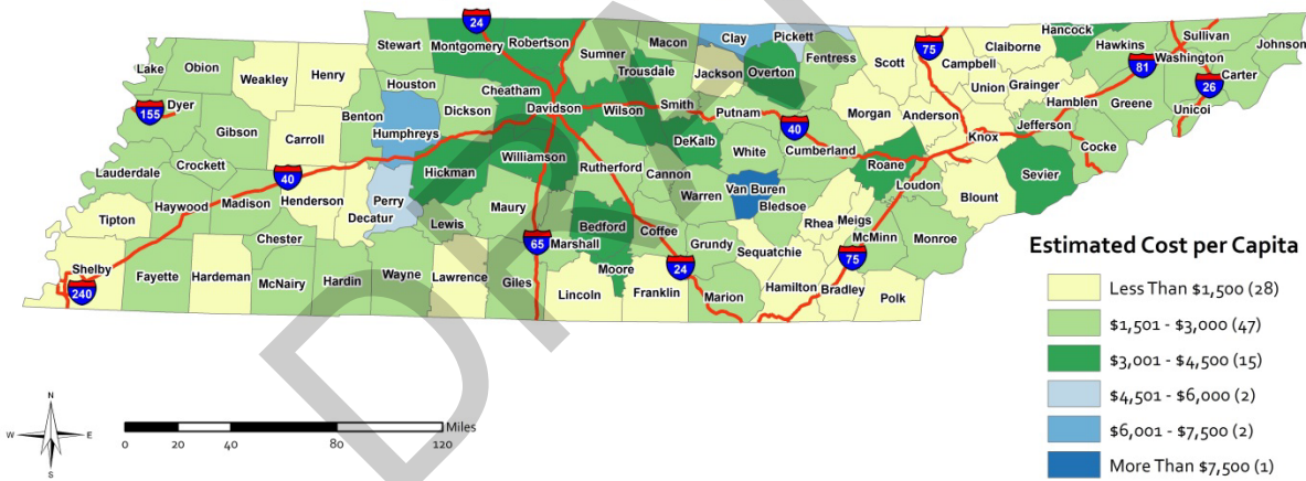
Map 7. Estimated Cost of Total Infrastructure Improvements Needed Per Capita Five-year Period July 2014 through June 2019

The state's second smallest county, with a population of only 5,633, Van Buren has needed $25 million since 2006 to install and replace water lines. Clay, with a population of 7,765, has needed $20 million since 2002 to construct gas lines throughout the county and connect to the city of Celina. Much larger, with a population of 18,135, Humphreys County has needed $10 million to replace a bridge and $8 million to provide water and sewer at an industrial park since 2007. Planned improvements to State Route 13 in Perry County, with a population of 7,822, increased from $7.5 million to $10.7 million. Pickett County, with a population of 5,124, has needed a new high school for ten years now, estimated to cost a relatively modest $15 million. Needs of this size would not be significant in a county with a large population, but they are big enough to cause these small counties to have the largest infrastructure needs per capita. Outside of these five counties, infrastructure needs appear to be better aligned with