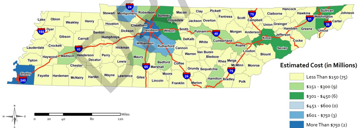
Map 1. Total Estimated Cost of Infrastructure Improvement Needs Five-year Period July 2014 through June 2019

Five counties—Davidson and Shelby in the first tier for needed infrastructure improvements (dark blue in map 1), and Rutherford, Williamson, and Montgomery counties in the second tier (medium blue in map 1)—account for 42.7% ($5.9 billion) of the $13.8 billion needed for infrastructure improvements reported by local officials. Shelby and Davidson are also in the top tier (shaded dark blue) for total population in map 2, cost of completed improvements in map 4, property values in map 5, and taxable sales in map 6. They are the first and second most populous counties and are home to a quarter of the state's population. Between 2000 and 2014, Davidson and Shelby experienced the second and eighth greatest population growth in the state—Davidson grew by 98,027 and Shelby by 40,524. Not surprisingly, besides