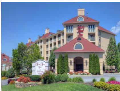
Music Road Inn and Conference Center 314 Henderson Chapel Road, Pigeon Forge, TN

The regional TIBRS training classes for East Tennessee have changed locations. The classes will no longer be held at the Civic Center in Sevierville, TN. The June and August classes in East Tennessee will be located at the Music Road Inn and Conference Center in Pigeon Forge, TN (the same location as the annual TIBRS Conference). Please note that the dates and times for these classes have not changed, only the location. An updated TIBRS Training Schedule is provided on pages 3 and 4 for your convenience. If you have any questions or concerns about the location for the East Tennessee training classes, please contact Dale King or Jackie Vandercook.