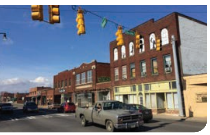
Traffic Signal Coordination