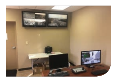
Traffic Operations Center