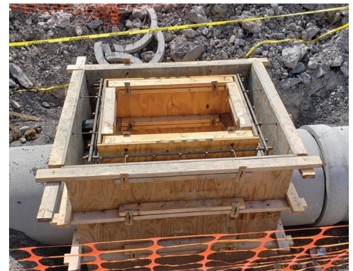
Catch basin installation near W. Hamilton.