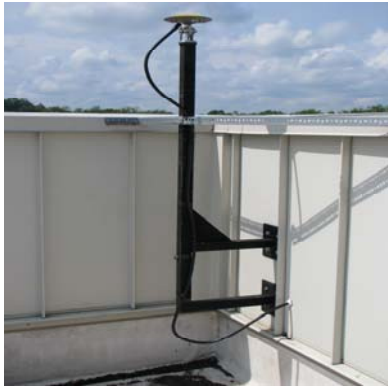
View mount attached to bldg