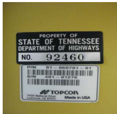
Receiver serial number