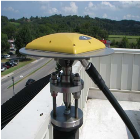
View looking north