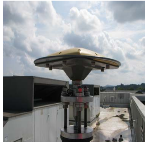
View looking east