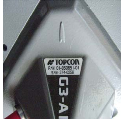
Antenna serial number