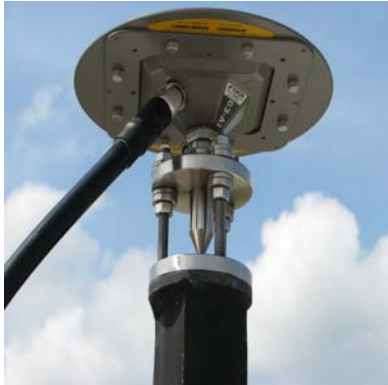
Antenna attached to monument