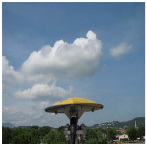
View looking west