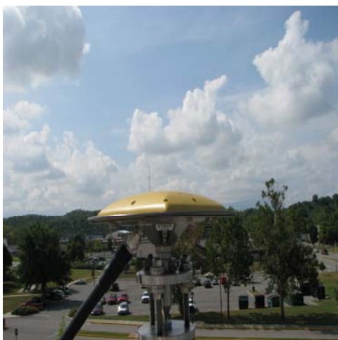
View looking south