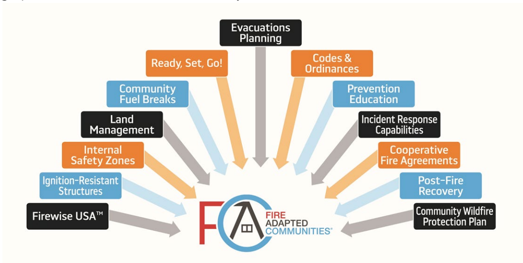
Components of a Fire Adapted Community: Fire Adapted Communities Toolbox

A fire adapted community accepts fire as part of the natural landscape. The community understands its fire risk and takes action before, during and after a wildfire to minimize harm to residents, homes, businesses, parks, utilities, and other community assets. These collective actions empower all residents and other stakeholders to be safer in their environment. The graphic below shows many elements of the concept. The elements have been evolving and changing over time...just like a community needs to adapt over time. A community using the FAC concept may not have to address all elements shown in the graphic, however, it is important for a community to consider how important all elements are to the community. In a way, you can consider the elements of the graphic as a checklist for the community to consider.