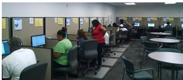
AJC Resource Rooms are available and equipped with computers, fax machines, and printers for job related functions for job seekers to utilize during their job search. AJC Staff are available to assist.

Under this current model, we have hosted about 18 hiring employers and over 250 job seekers on site for one event! This allows employers have great flexibility in searching for qualified workers, and job applicants have easy, efficient access to job openings.